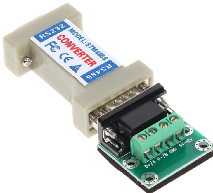
RS-232 to RS-485 interface converter.