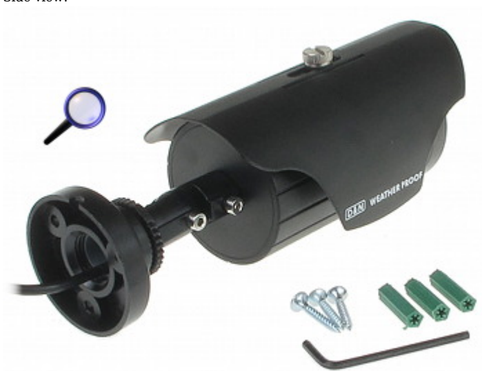
Dimensions with bracket: