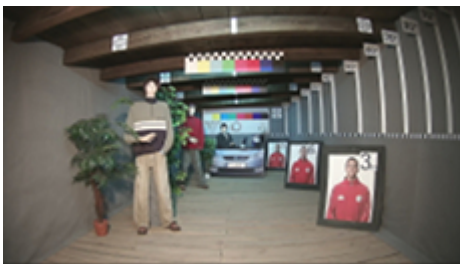
Camera image at artificial illumination (about 30Lux):