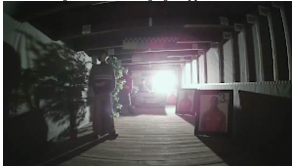
Camera image at night conditions, at different illumination values show below: