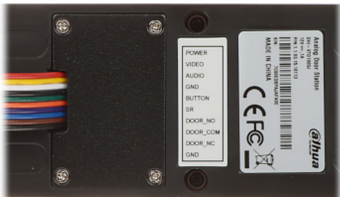
INDOOR PANEL: Mounting side view: