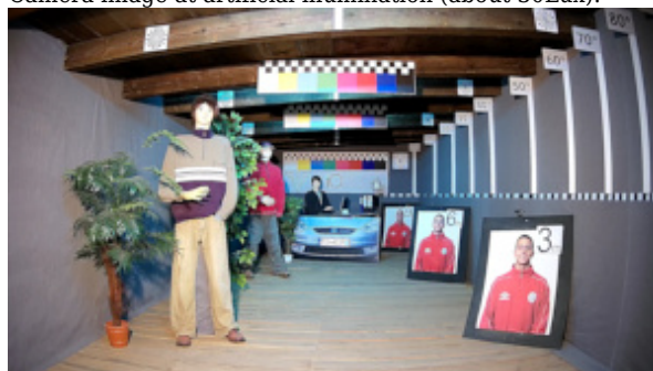
Camera image at artificial illumination (about 30Lux):