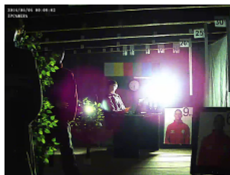
Record from camera during daylight operation: