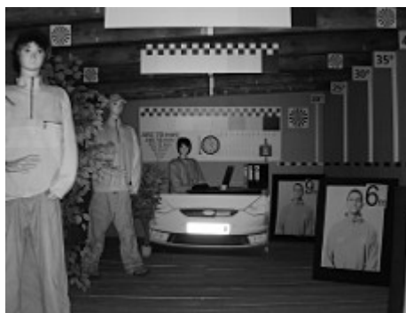
Camera image at direct strong light opposite to camera: