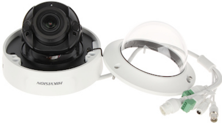
CVBS, SPOT output: