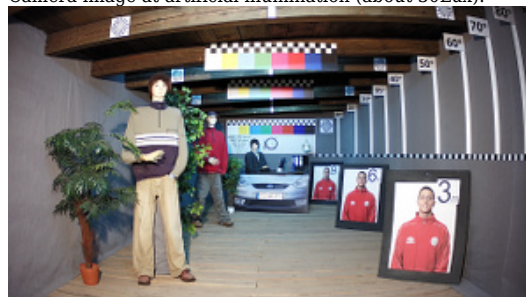
Camera image at artificial illumination (about 30Lux):

DELTA-OPTI Monika Matysiak; https://www.delta.poznan.pl POL; 60-713 Poznań; Graniczna 10 e-mail: delta-opti@delta.poznan.pl; tel: +(48) 61 864 69 60