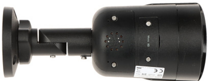
Memory card slot and "Reset" button: