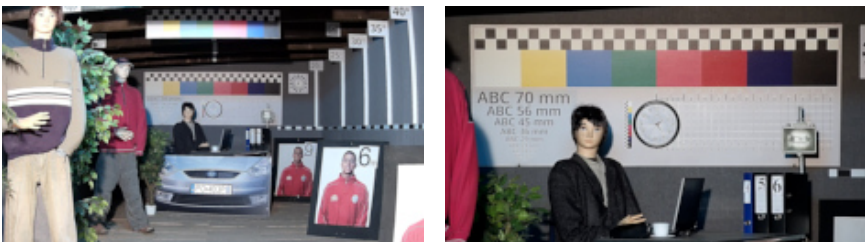
Camera image at artificial illumination (about 30Lux):