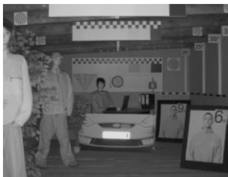
Camera image at direct strong light opposite to camera: