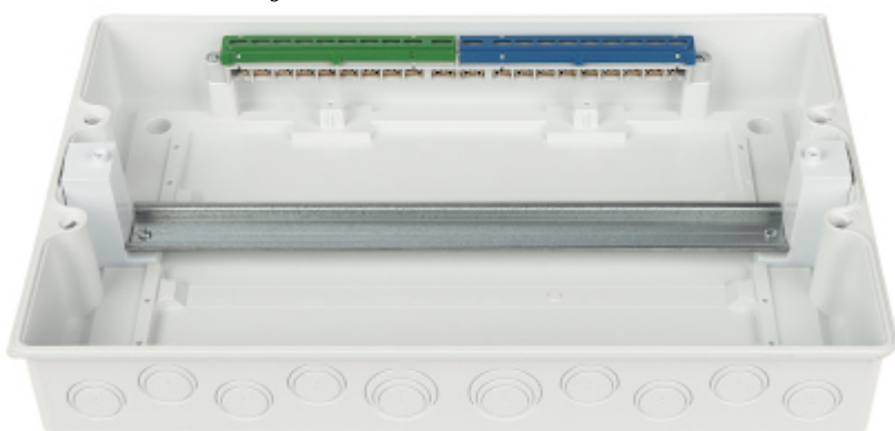
Connecting terminals view: