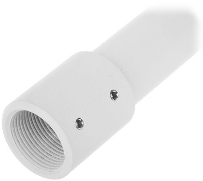
View of the ceiling mounting side: