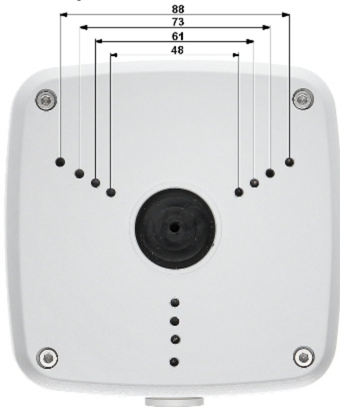
View of the ceiling mounting side: