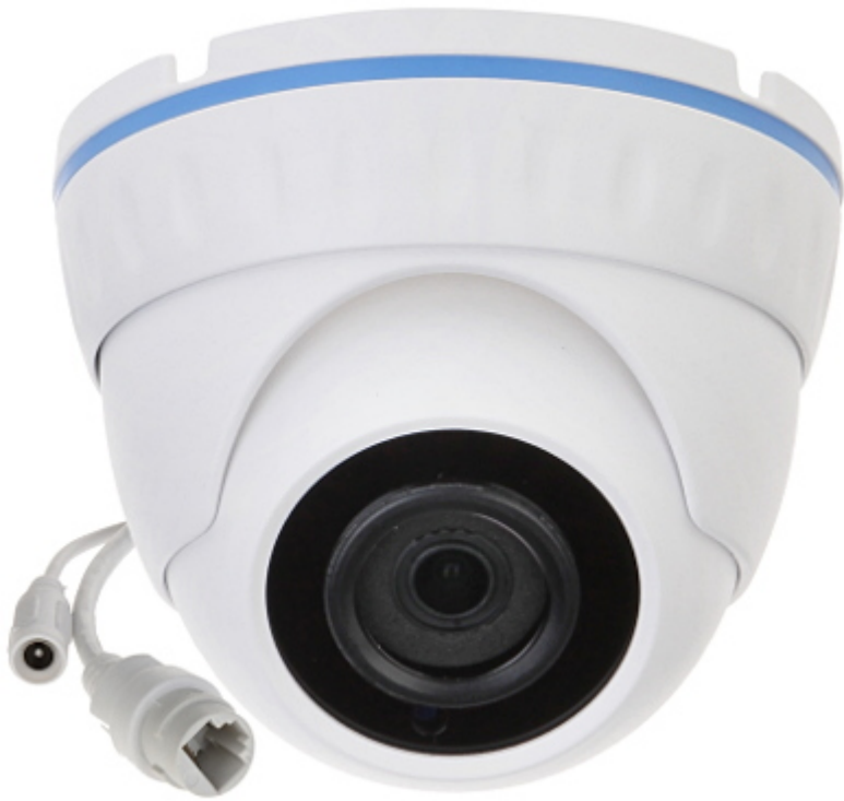
Camera is out from clamping ring: