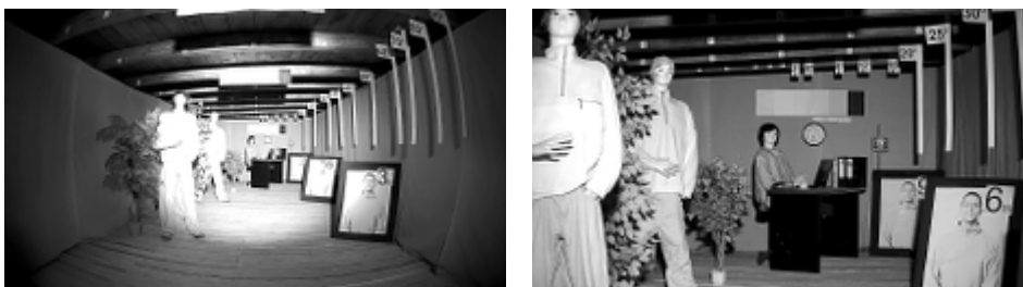
Camera image at night conditions, at different illumination values show below: