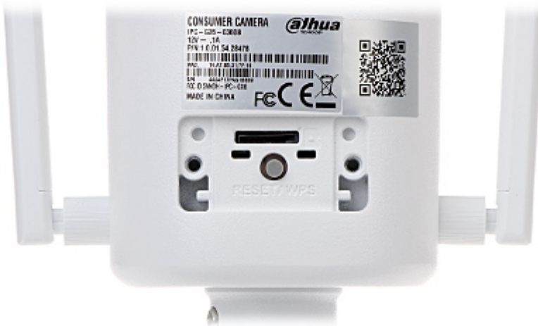
Camera mounting side view: