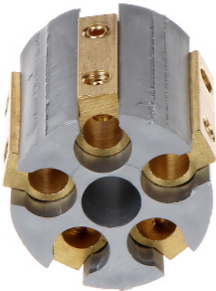
Method of mounting: