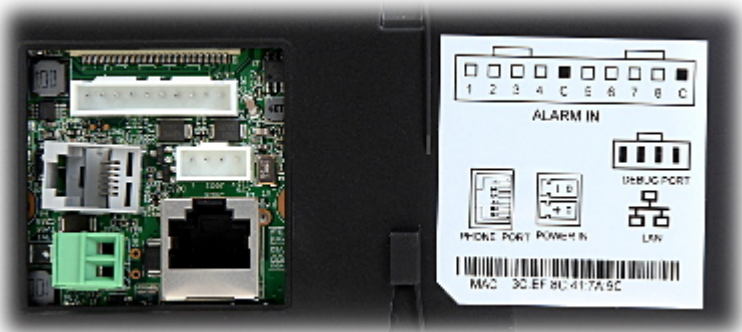
Examples of connection diagrams: