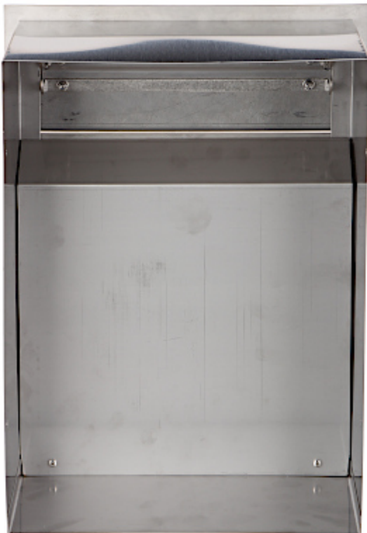
Front panel - view from the wall side: