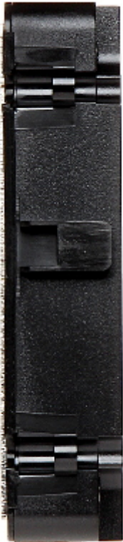
Example of application: