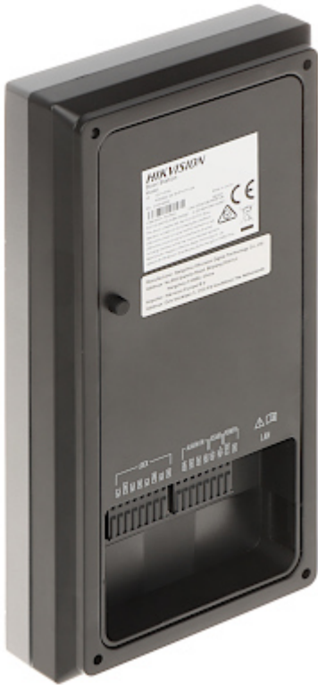
Internal view (after open the enclosure):