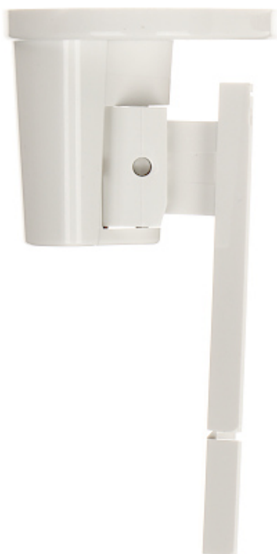
View of the ceiling mounting side: