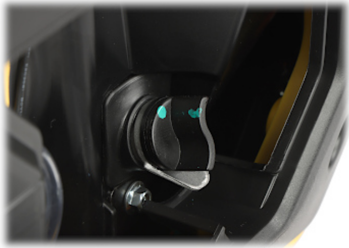
Spark plug access: