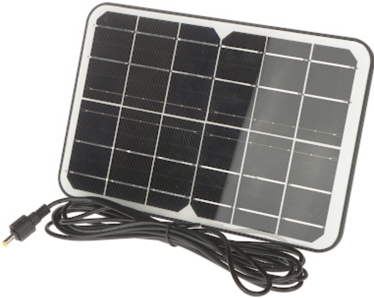
Solar panel connector: