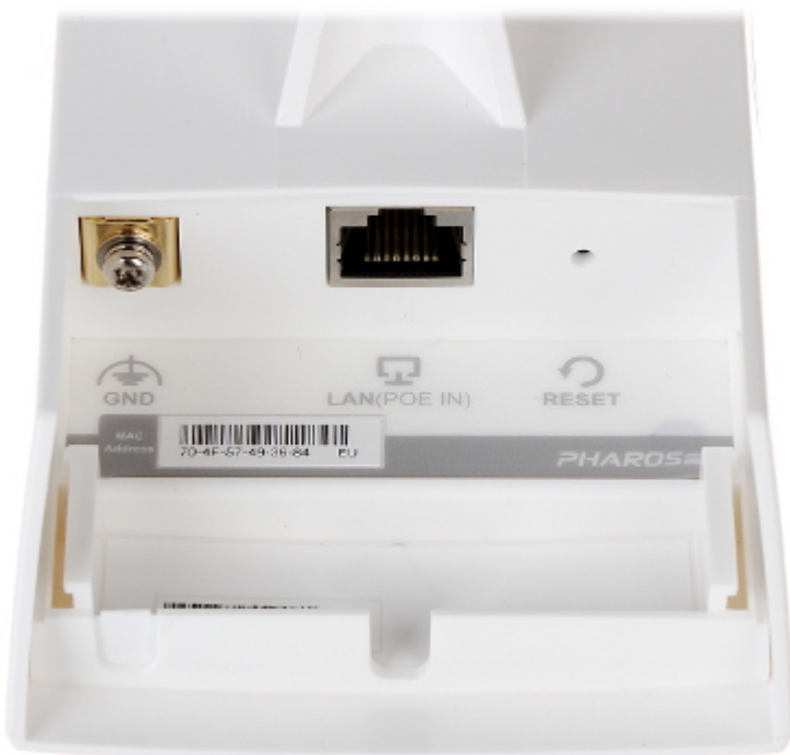
PoE Power Supply and Adapter: