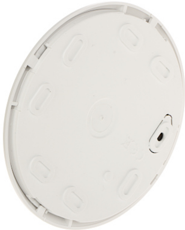
Description of particular elements of the device: