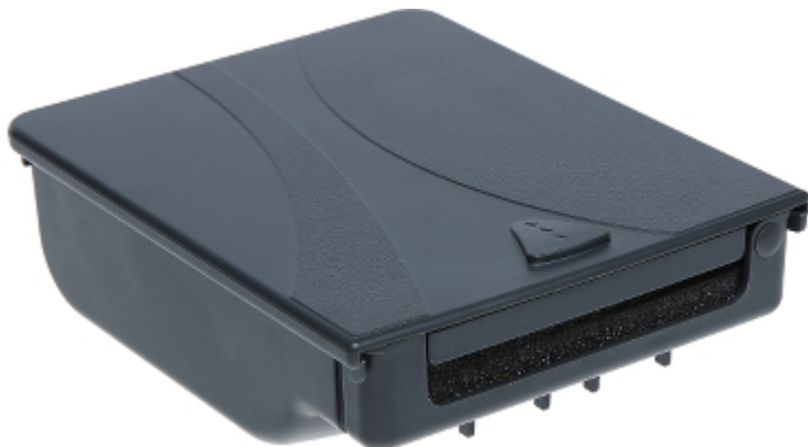
Destacker (mounted near by receiver):