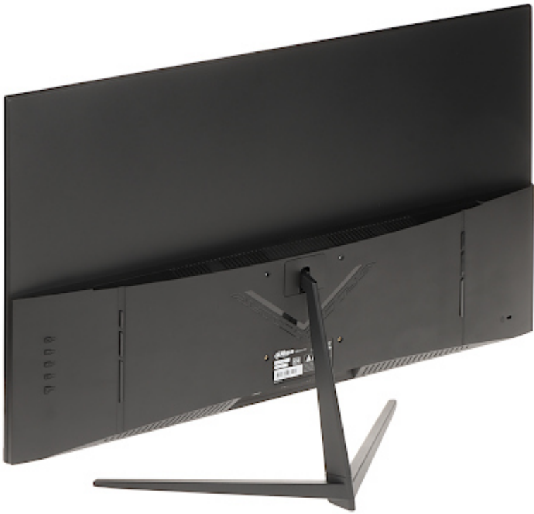
OSD menu control keys: