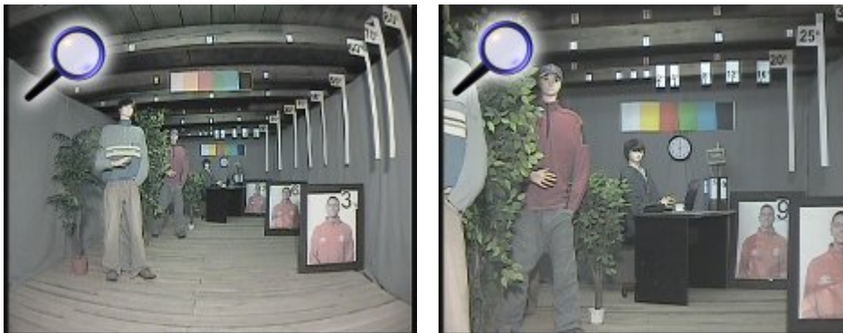
Camera image at night conditions with internal built-in IR illuminator on: