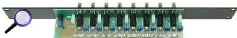
Front panel BNC connectors: