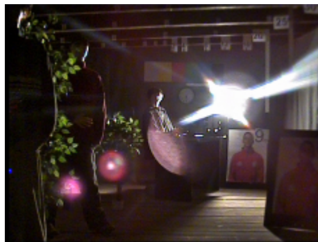
Camera image at night conditions, at different illumination values show below: