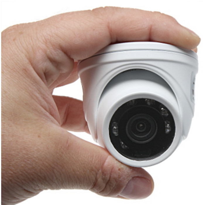
Camera mounting view: