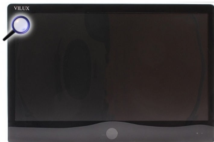
Side view (control keys visible):