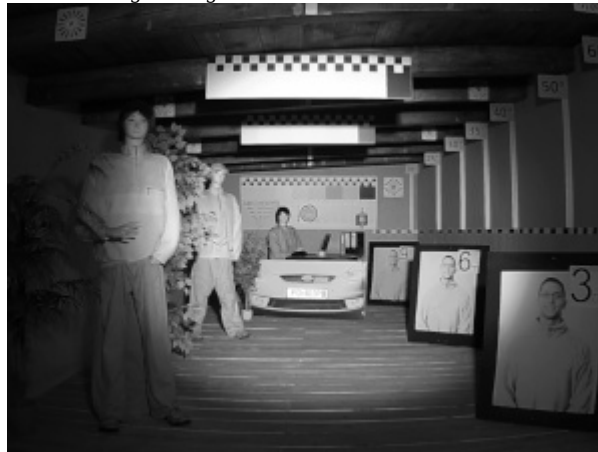
Camera image at night conditions, at different illumination values show below: