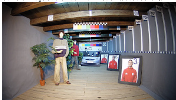
Camera image at artificial illumination (about 30Lux):