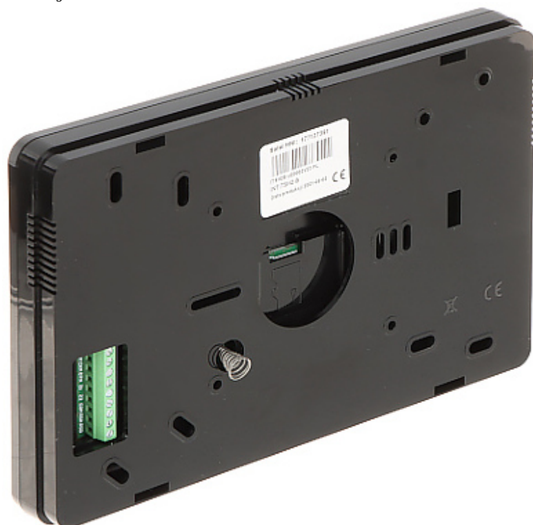
View after remove the cover: