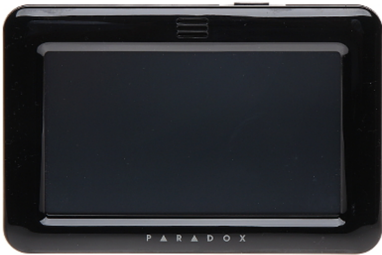
View after remove the cover: