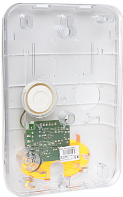
In the kit: