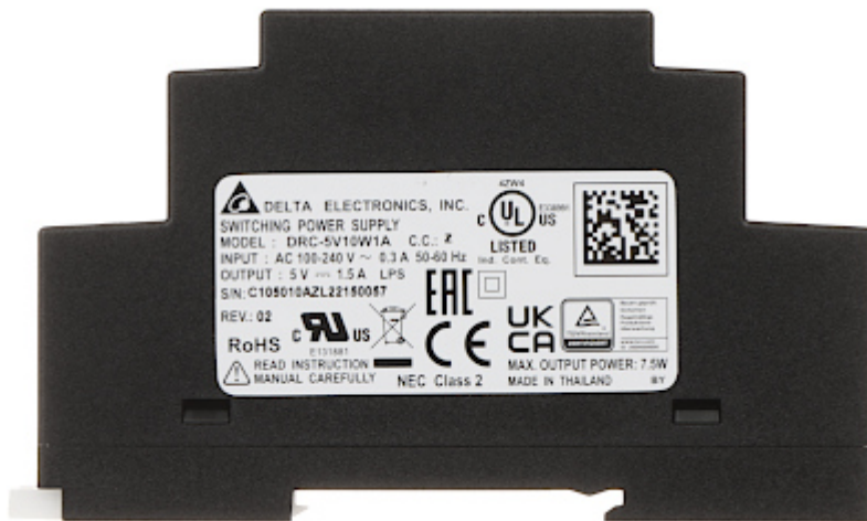
Rear panel (DIN rail installation):