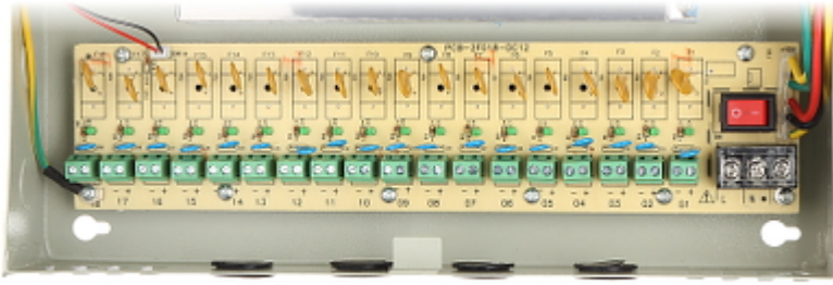
Power adapter view in lockable casing: