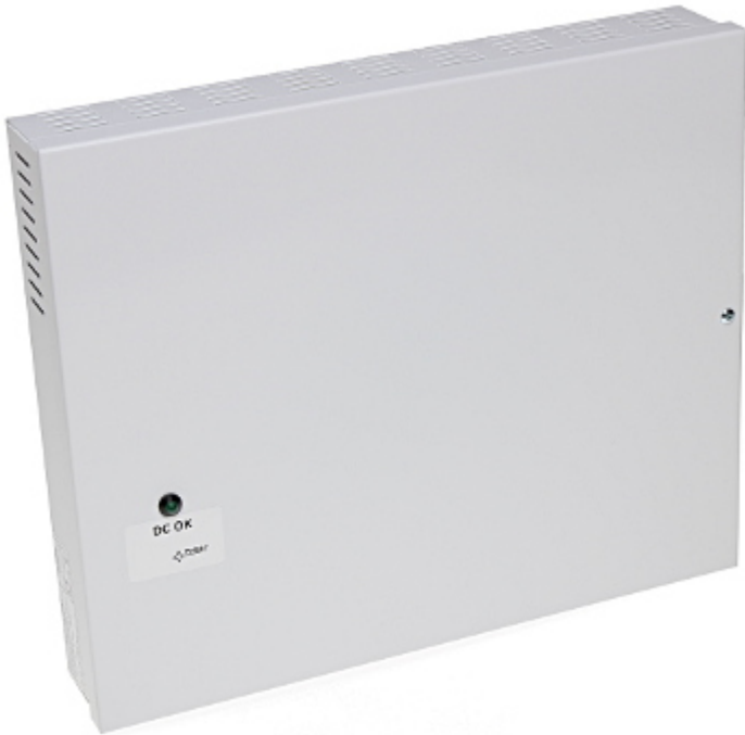
Front panel view: