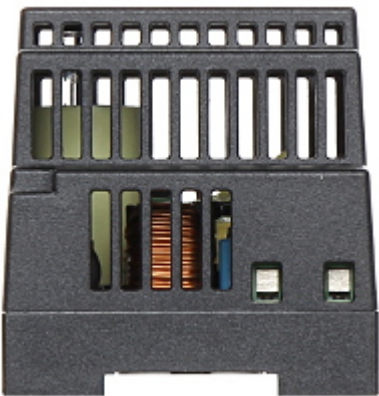
Rear panel (DIN rail installation):