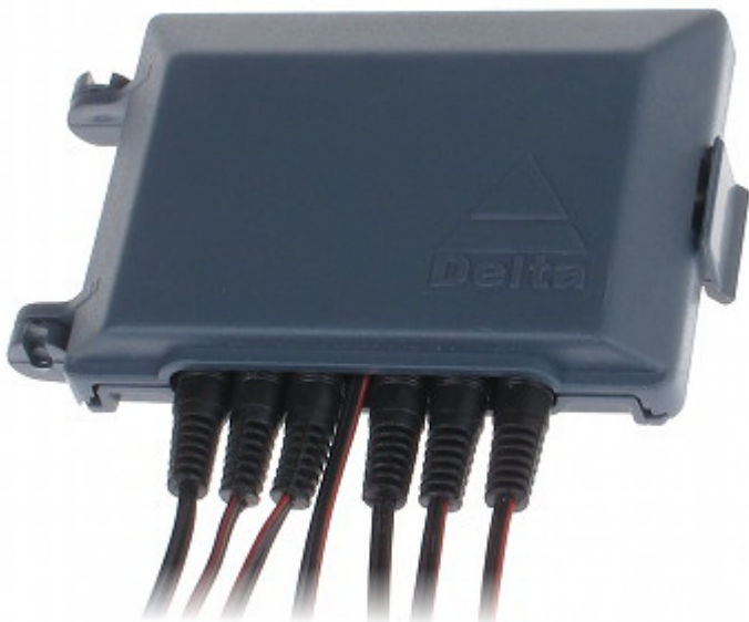
The housing construction enables easy mounting the device on a wall or mast, using tie for example: