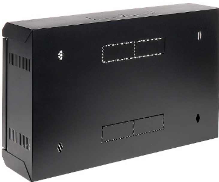
In the kit: