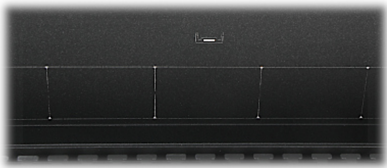
Holes for fan coolers: