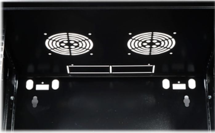
Cable entry in the floor: