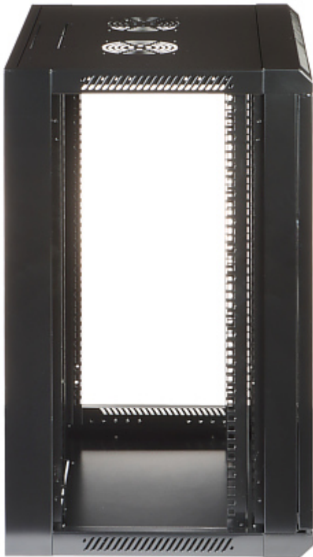
Holes for fans and cable entries: