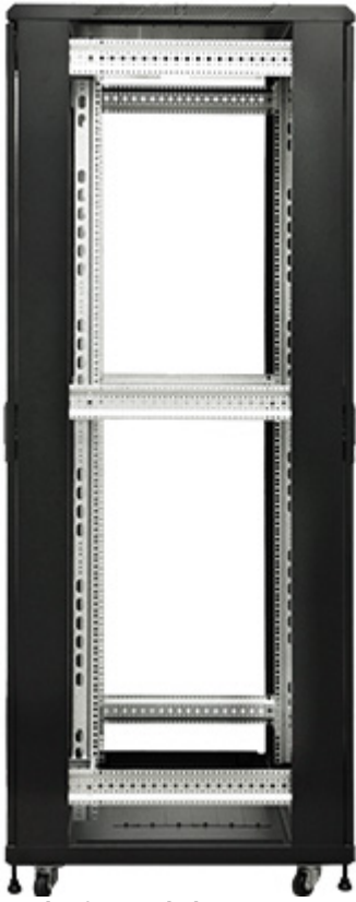
Example of use with the P19F/550*P2 shelf: